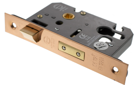
Product Finish Pictured: Urban Satin Copper (USC)